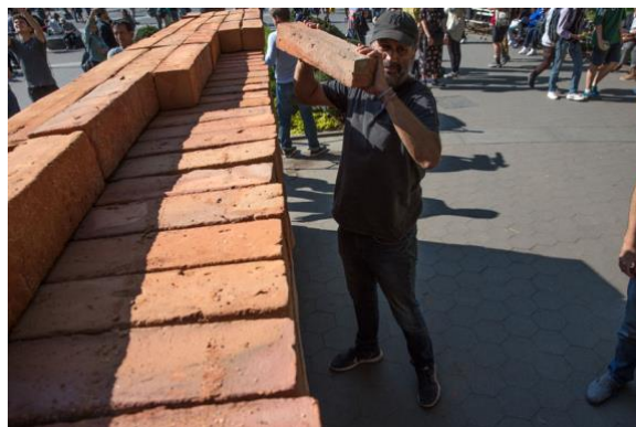
Bosco Sodi, Muro . Installation view in Washington Square Park, New York. September 2017. By Diego Flores and Chris Stach

Bosco Sodi (b. 1970, Mexico City) is a New York-based Mexican artist known for his richly textured, vividly colored large-scale paintings and sculptures. Sodi plumbs the emotive power within the essential crudeness of the materials that he uses to