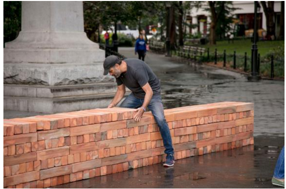
Bosco Sodi, Muro . Installation view in Washington Square Park, New York. September 2017.