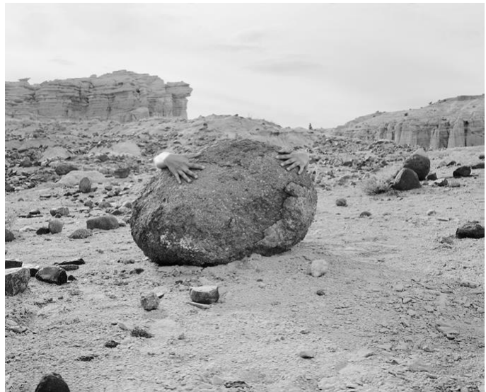
Koyoltzintli, Untitled , Bisti/De-Na-Zin, New Mexico, from the series MEDA , 2018/19. archival pigment print. 24 x 30 inches.

Join us for two student-led tours of the exhibition Native America: In Translation . The tours are free and open to the public.