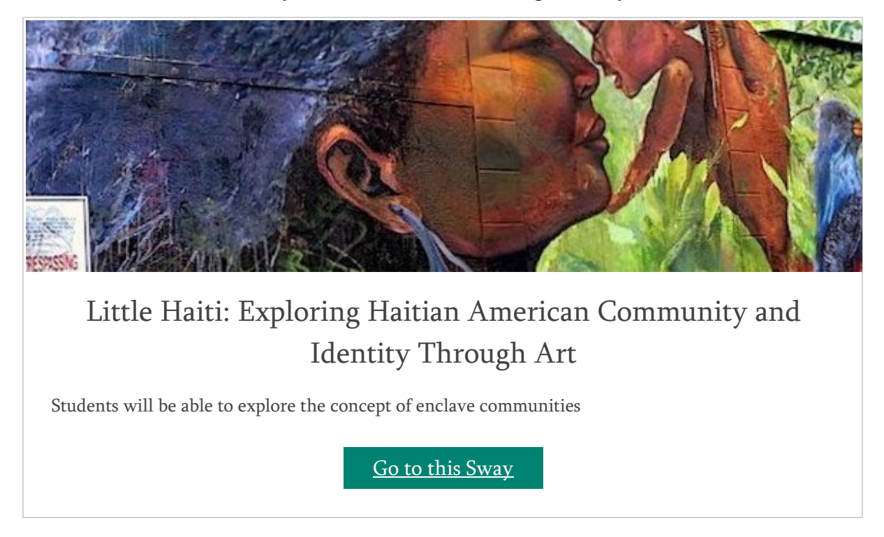
Step 2: Play the Sway presentation by clicking PLAY at the top right corner of the screen.

Insert the below visual link into your school's Student Management System for students or an email.