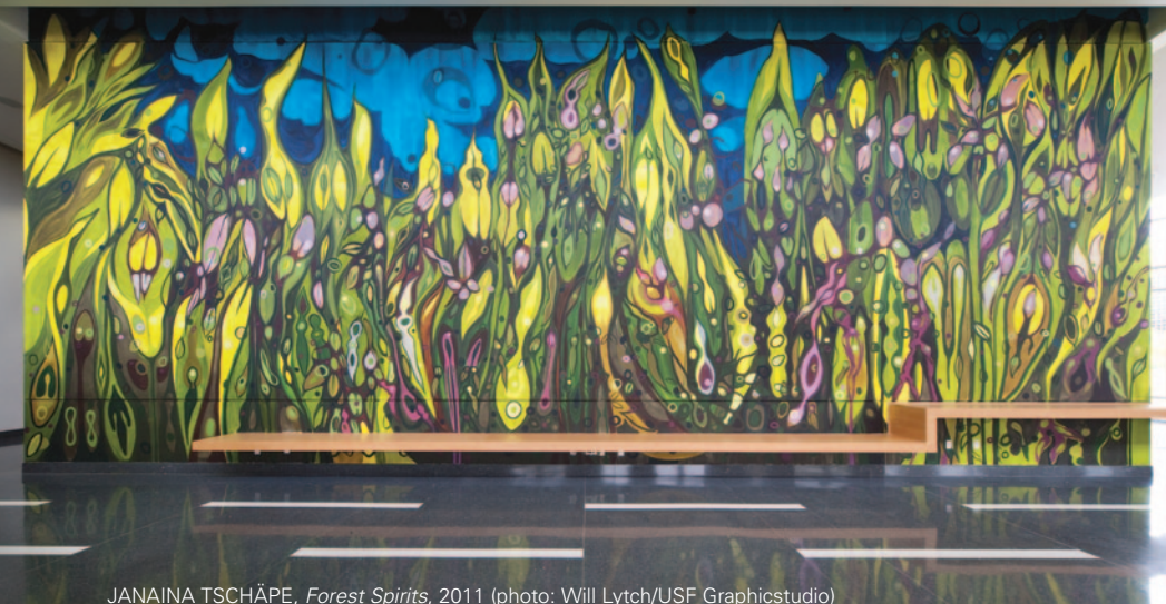
JANAINA TSCHÄPE, Forest Spirits , 2011